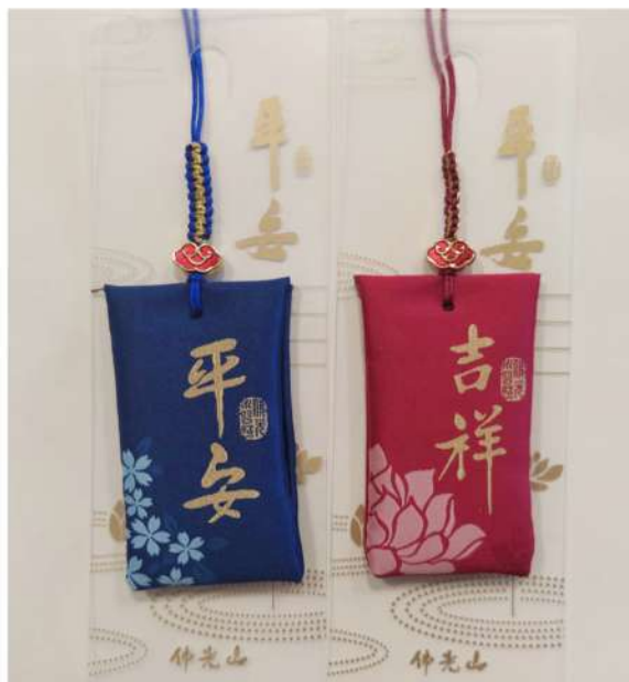
Tokens given out during Examination Blessing 2023

We are immensely grateful for everyone's support in ensuring the events and activities are carried out in a safe manner. It's wonderful to have you with us!